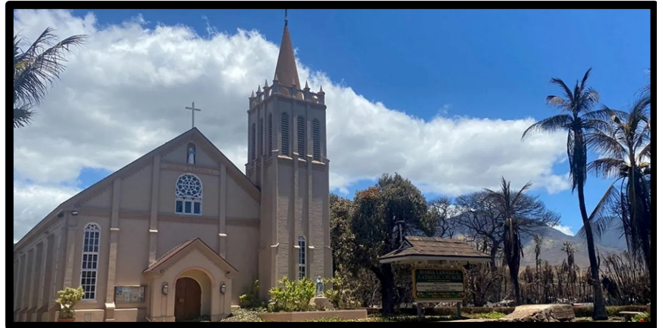
Maria Lanakila Catholic Church, Lahaina, HI